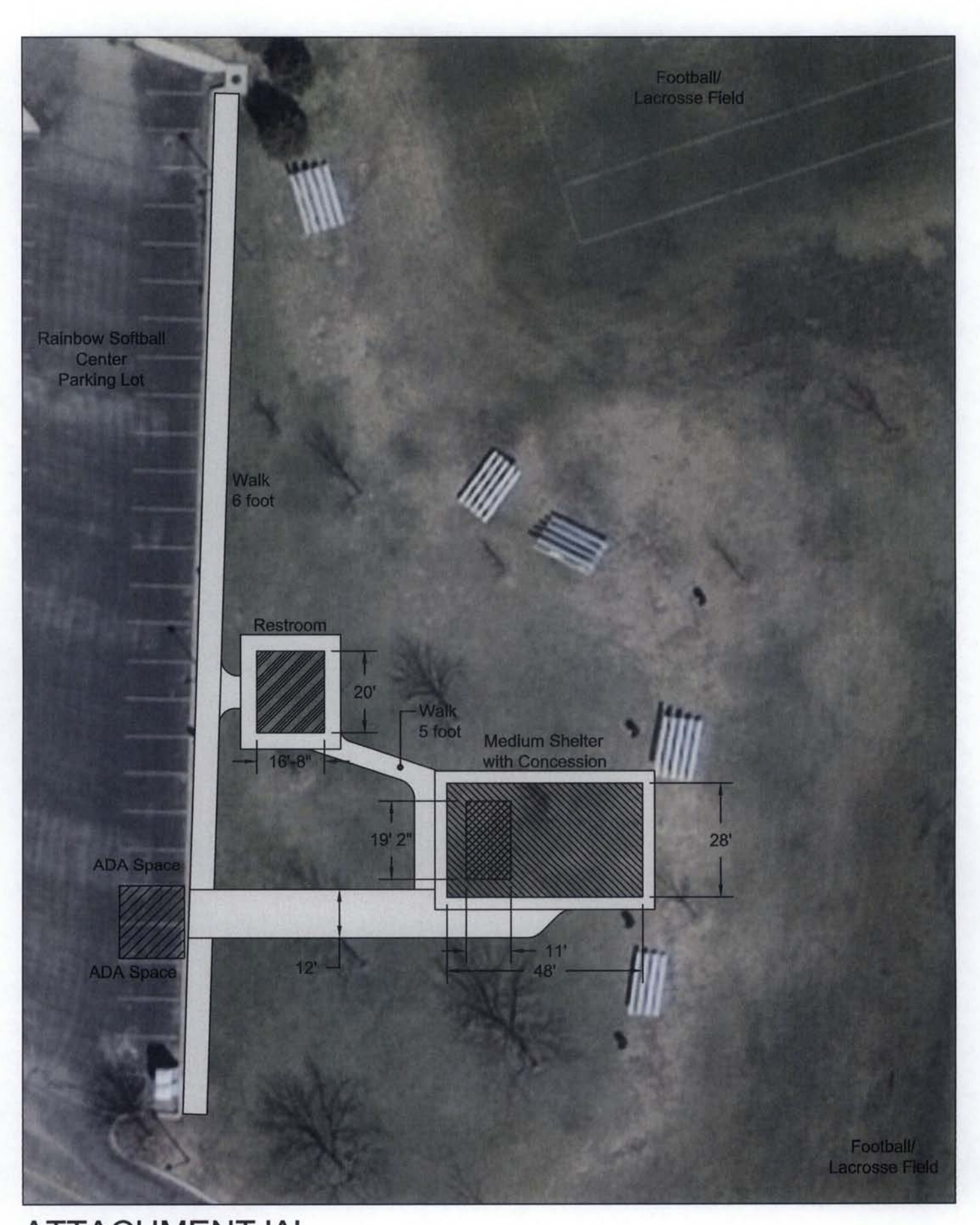
ATTACHMENT 'A' Shelter/Concession and Restoom