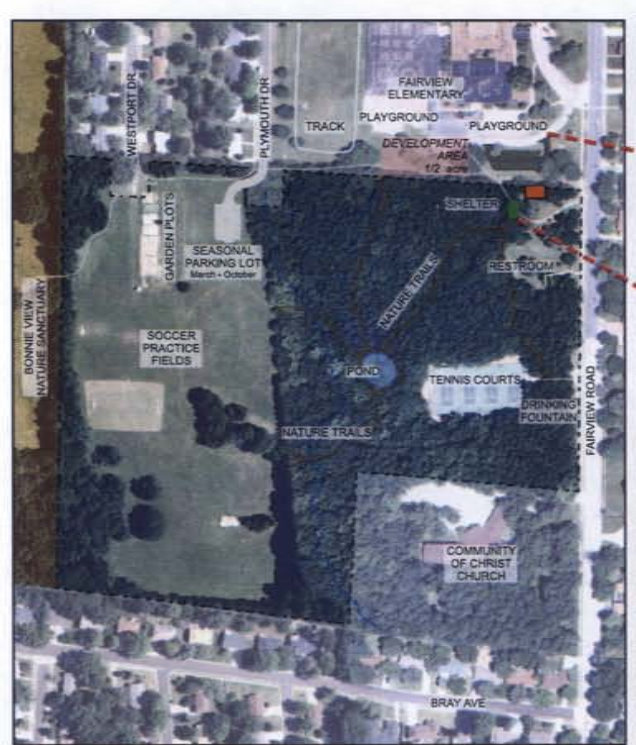
Fairview Park 27.2 Acres