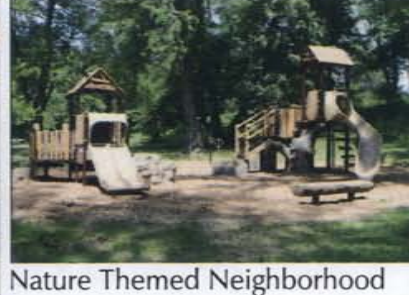
Park Playground 30550' area