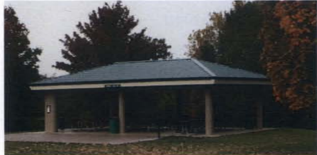
Medium Shelter 24x48'